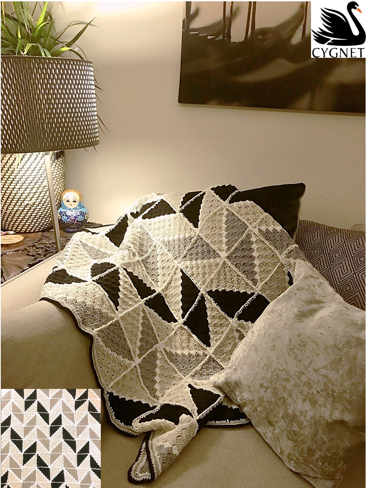
CY1165 COTTONY DK GEO-MONO BLANKET